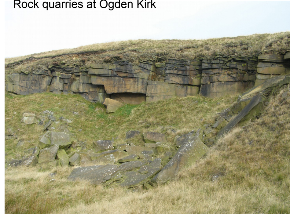
Plant fossils are seen on the fallen blocks below the quarry face