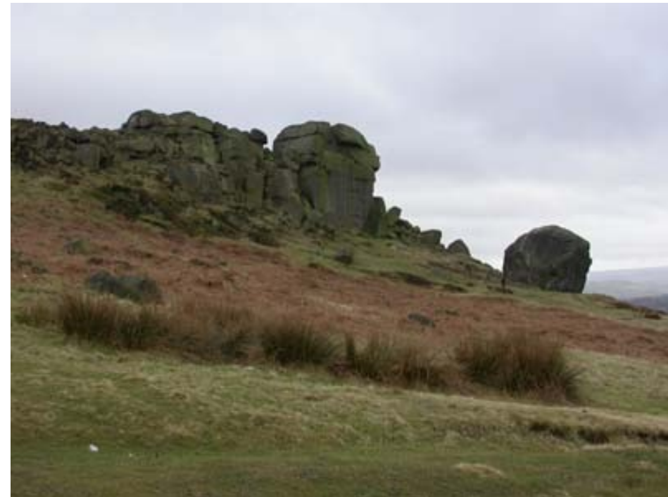
The Cow and Calf rocks

If you want to find out more about the West Yorkshire Geology Trust contact team@wyorksgeologytrust or look at our website www.wyorksgeologytrust.org