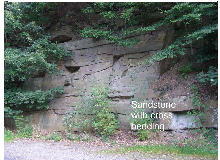
View of Hartley Bank Quarry from the car park

If you want to find out more about the West Yorkshire Geology Trust contact team@wyorksgeologytrust or look at our website www.wyorksgeologytrust.org