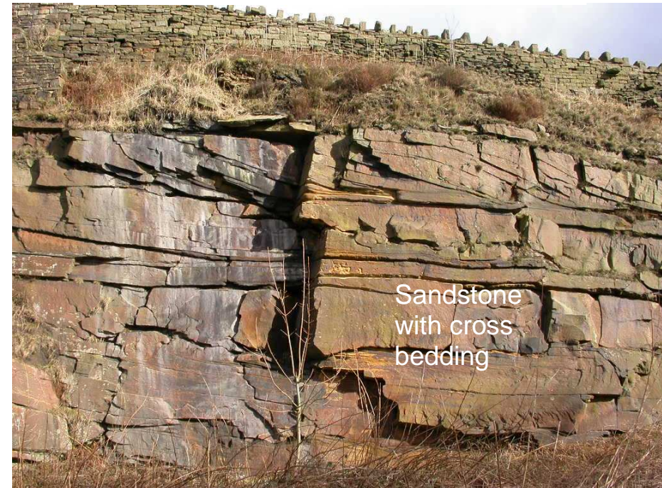
View of Bingley Quarry from the car park

If you want to find out more about the West Yorkshire Geology Trust contact team@wyorksgeologytrust or look at our website www.wyorksgeologytrust.org