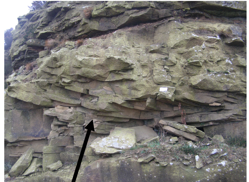
Cross bedding in sandstones in Wellfield Quarry

If you want to find out more about the West Yorkshire Geology Trust contact team@wyorksgeologytrust or look at our website www.wyorksgeologytrust.org